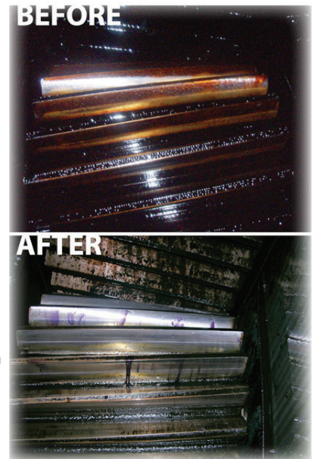
Mill gears shown before and after conversion from asphaltic to Pyroshield lubricant.

Note: No lubricant can overcome weak foundations, poor gear alignment, undetected vibrations, poor maintenance and an inadequate lubrication system. Any of these problems will add extra loads of unknown magnitude on top of the designed gear load and need to be addressed separately to prevent gear damage.