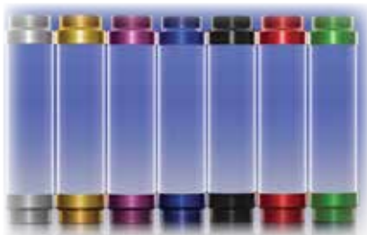
Clear Grease Tubes with Color Options