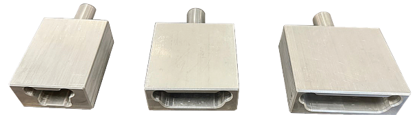
Small, Medium & Large Holders