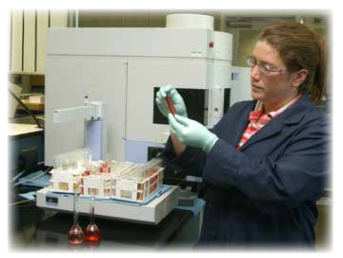
Results are available soon after testing is complete. LE prepares a detailed report for the customer, explaining the data and providing recommendations for any follow-up actions that should be taken.

To properly lubricate and cool the bearings and gears, a turbine oil must resist oxidation, ensure water separability and prevent the formation of varnish, sludge, rust and foam. Any change in these performance properties, or in the oil's other physical parameters, requires attention.