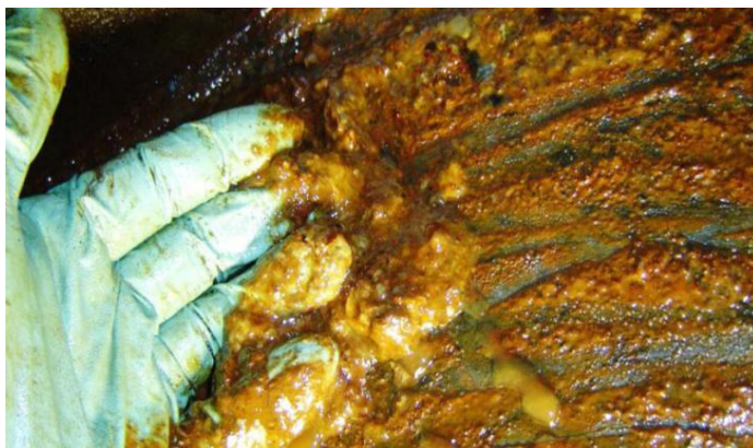
Figure 3 – Sludge