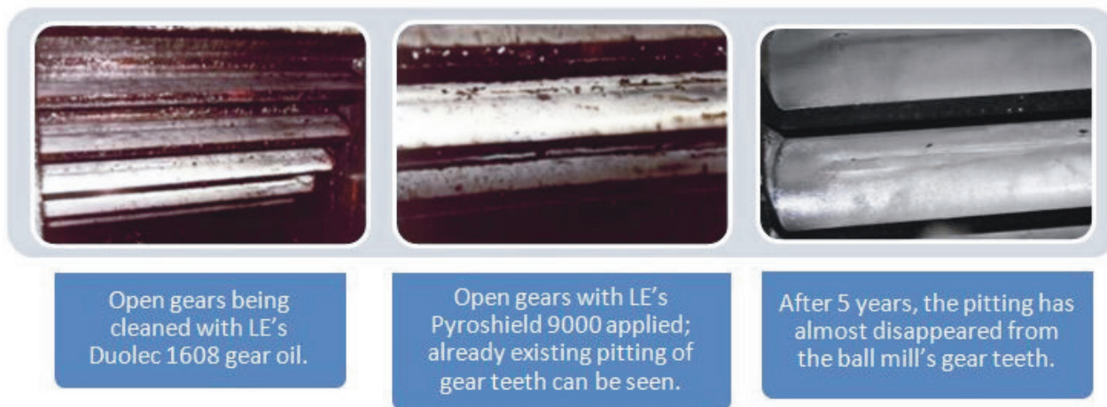
Figure 1. Gear healing solution on ball mill open gears at Titan Cement, Halkis, Greece.

demonstrating that there is improved distribution of load.