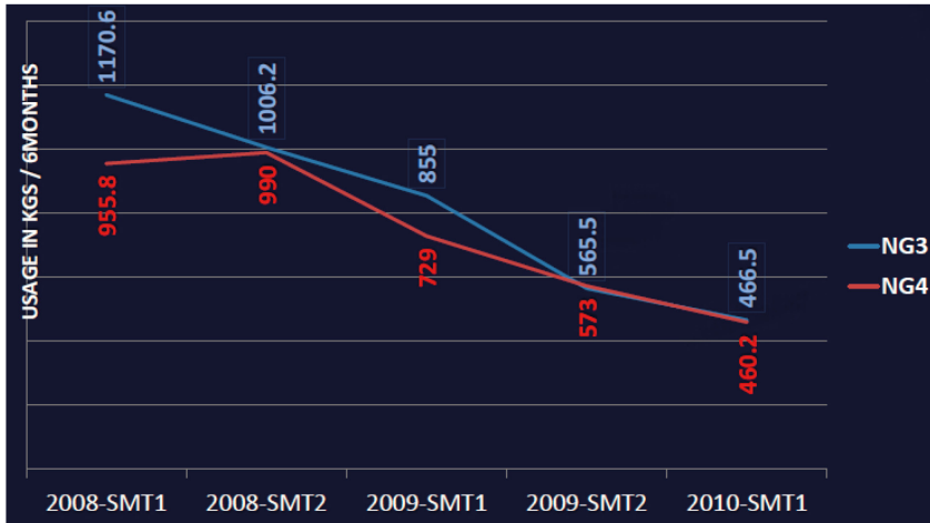
Figure 2. Reduction in consumption of enhanced open gear lubricant for two kilns at an Indonesian cement plant.