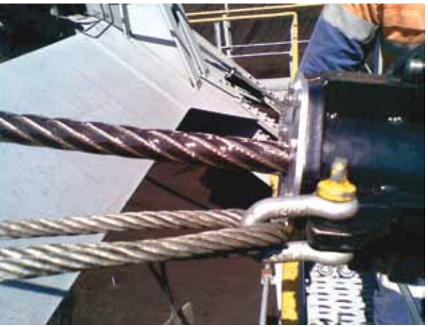
Freshly greased wire rope comes out of the back end of the Viper automatic lubricating unit.

In another study involving 5-ton and 10-ton overhead cranes in the United States that used 3/8-inch and 5/8-inch diameter ropes, the average life of the ropes was doubled. The authors attribute this increased performance to the ability of the penetrating lubricant to displace water and contaminants while replacing them with oil, which reduces the wear and corrosion occurring throughout the rope. A good spray with penetrating wire rope lubricant effectively acts as an oil change for wire ropes.