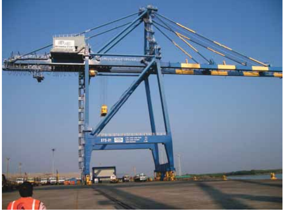
Large dockside cranes (also known as container cranes or ship-to-shore cranes) are used for loading and unloading containers from ships. Wire ropes are an essential part of the crane's operation, and they must withstand demanding environmental conditions. Without proper lubrication, they require frequent repair or replacement.

four 44-mm ropes was extended from an average 18.5 months to 43 months. At another mine, life cycles of four 43-mm x 2073 meter ropes were extended from an average eight to 12 months.