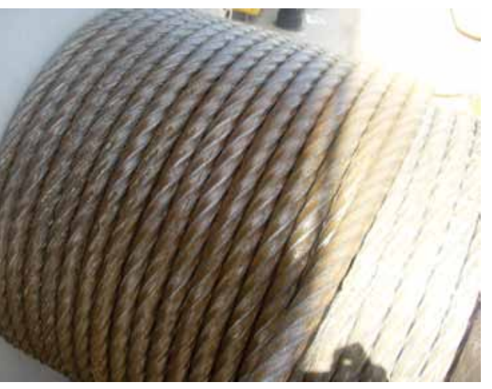
Wire rope that is properly treated on a regular basis with penetrating and coating lubricants will be protected from the elements and other negative factors and will provide a longer useful service life.

lubricant on a rag and apply it directly to the rope. This does not thoroughly, adequately do the job, Grimes says. It is also time-consuming and a housekeeping challenge, as well as detrimental to the environment because of the mess created during application.