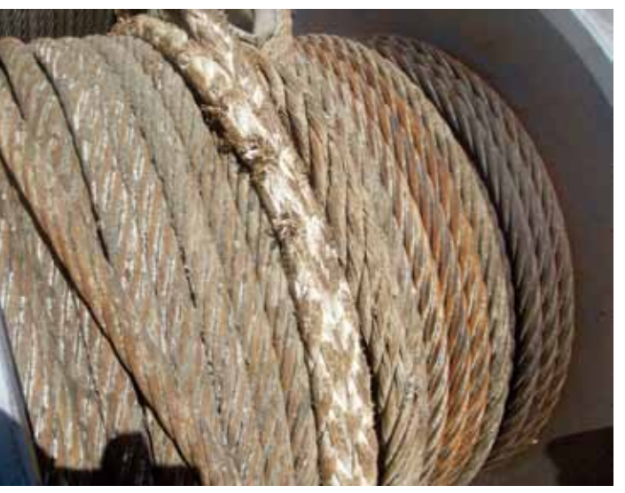
This spool of wire rope shows some of the damage that can occur due to a variety of factors, including worn sheaves, improper winding and splicing practices, improper storage, high stress loading, shock loading, corrosion, oxidation, and abrasive wear.

For example, LE has found that many people still use hand application to lubricate wire ropes. They place the