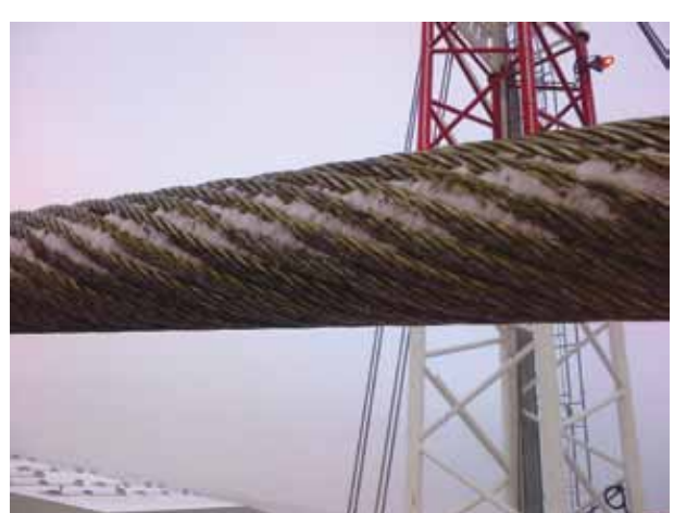
This 100-mm non-rotating wire rope used on an offshore crane is totally dry and covered in ice and snow prior to lubrication.

Wire ropes are lubricated during the manufacturing process. If the rope has a fiber core center, the fiber will be lubricated with a mineral oil or petrolatum type lubricant. The core will absorb the lubricant and function as a reservoir for prolonged lubrication while in service. If the rope has a steel core, the lubricant (both oil and grease