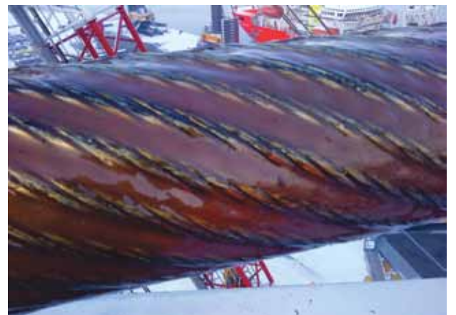
The same 100-mm non-rotating wire rope is shown after it was lubricated with LE's Wirelife Almasol Coating Grease using the Viper automatic lubricator. Notice the complete coverage of the rope.

"In addition to the branding, the nice thing about LE is that we've developed some high-end lubricant technology and innovative solutions. If you use these Wirelife lubricants, they are going to protect the rope longer; the rope won't break or fray. If you use the Viper automatic applicator, it will im-