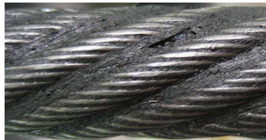
Left Lay – Counter Clockwise Rotation

Available for 6 and 8 strand ropes in a wide range of sizes, the following tables allow for the quick and easy selection of the correct VRC to suit your specific requirements.