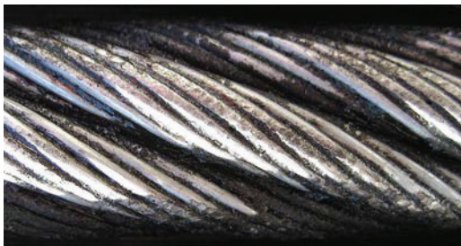
Right Lay – Clockwise Rotation

It is recommended that all ropes be physically measured prior to selecting and ordering the VRC, as ropes size may vary in service.