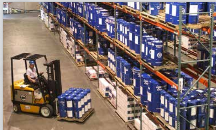
Nearly 60 percent of LE's lubricant orders are on the road the same day we receive them, while 95 percent go out in one day or less. Distribution comes out of Wichita as well as warehouses in Tennessee and California.