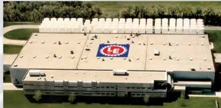
LE's state-of-the-art manufacturing facility, technology center, warehouse and office are located in Wichita, KS. Our nationwide network of trained lubrication consultants ensures timely onsite assistance after the sale. The company's international presence includes distributors in more than 60 countries.