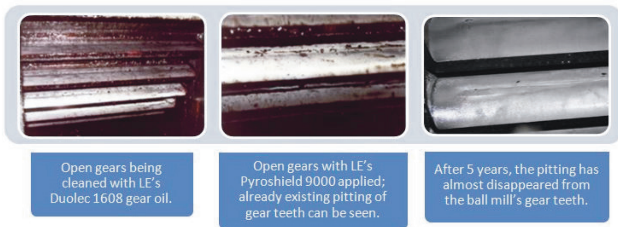
Figure 1. Gear healing solution on ball mill open gears at Titan Cement, Halkis, Greece.

reduced, demonstrating that there is improved distribution of load.